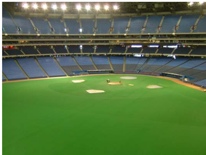
In Toronto we stay at the Renaissance Hotel at the Skydome - here the view from the bar