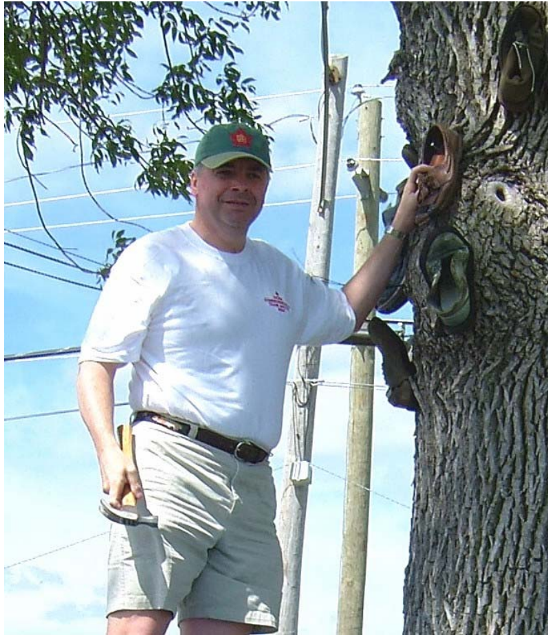
The Captain nails a pair of Timberlands to the shoe tree